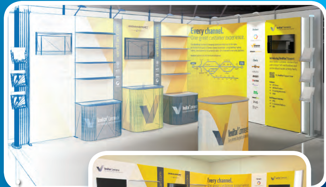
Example 3D colour visual of a proposed stand layout

We can also show you how your stand can be adapted to work in other stand spaces, which you may have booked at forthcoming events, so you can fully understand its long-term potential.