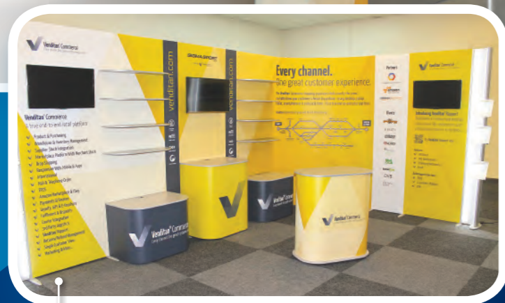
Photograph of the completed stand in our pre-build area